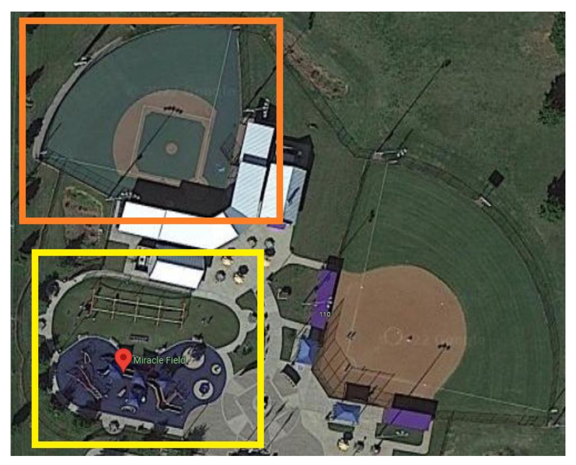
*The dirt field will not be included in the digitization process.

Yellow grid: Photogrammetry along with 360° videos and photos will be used to create an immersive VR experience where participants can move through the space while interacting with specific playground equipment (e.g., the zipline, swings, and musical equipment). As with the ball field, there will be an educational voiceover on adaptive equipment paired with certain areas of the playground.